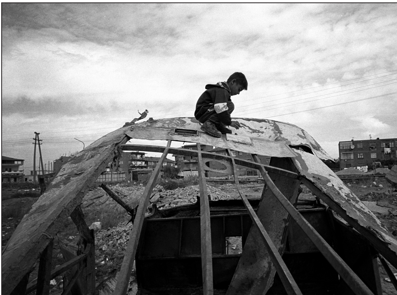
Kid playing in the surrounding of his house, Albania.