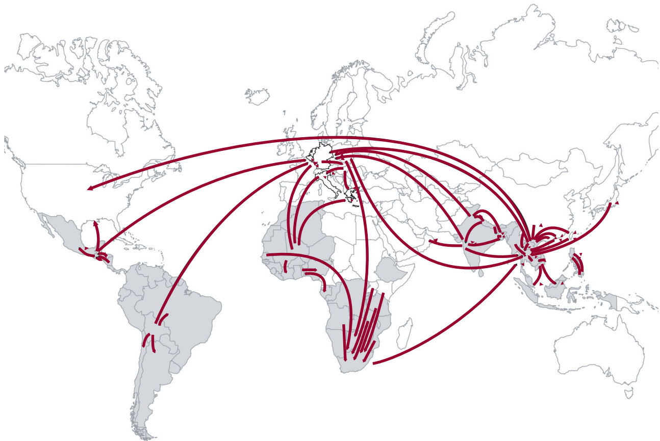
Diagram 1: Terre des Hommes findings