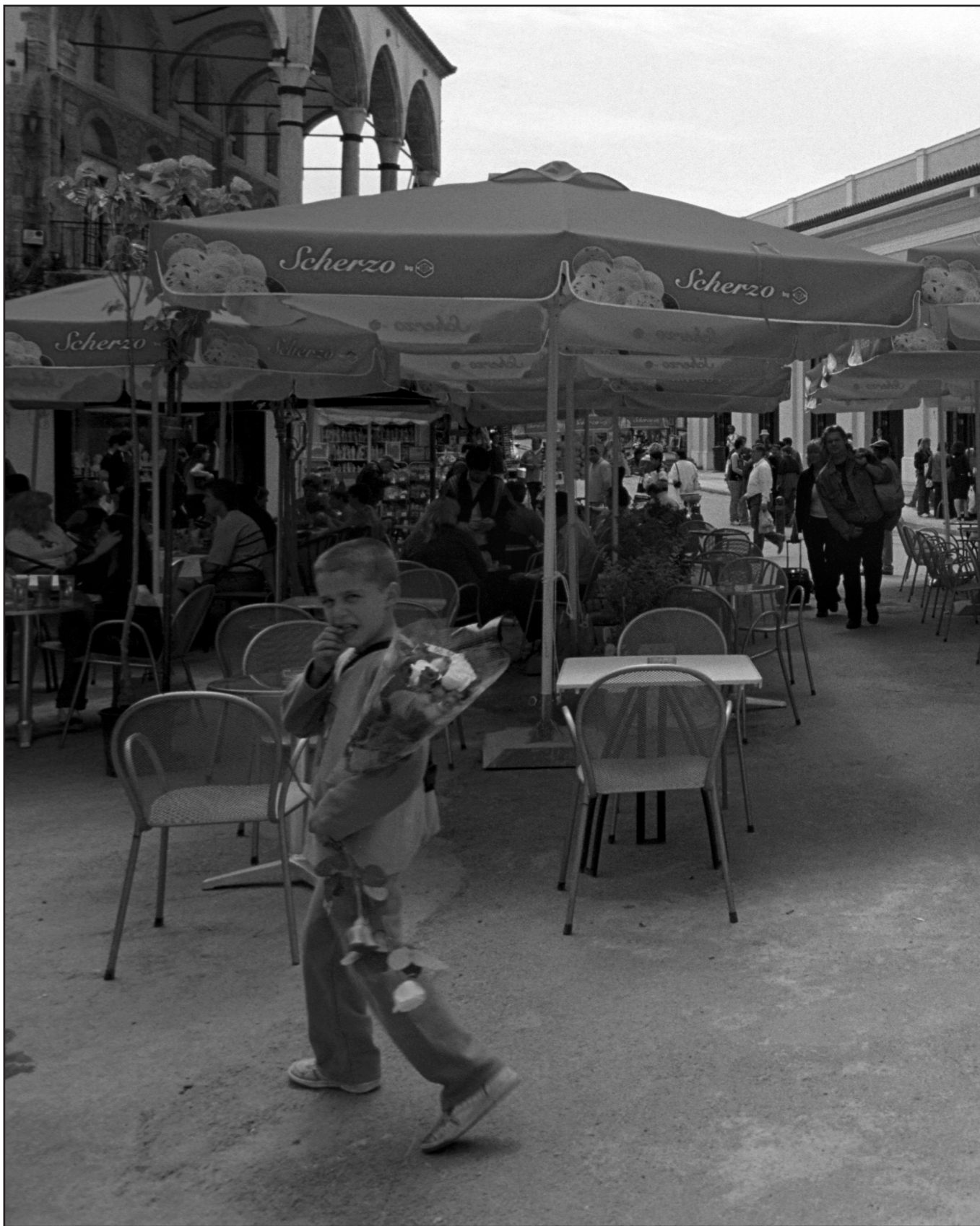
Boy selling flowers in a cafe. Construction to the right hand side and in the background for the Olympic Games 2004. Monastiraki Athens.