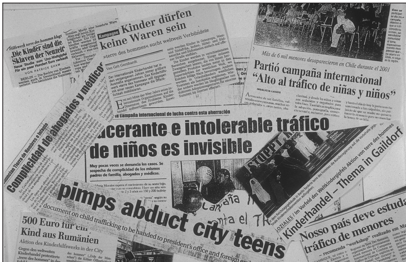
Child Trafficking is becoming an increasing concern in public opinion, Photo by Christel Kovermann

development and humanitarian relief, as well as to child trafficking more specifically. It has been compiled through extensive document analysis as well as numerous interviews with institutional stakeholders at EU level involved in the fight against child trafficking.