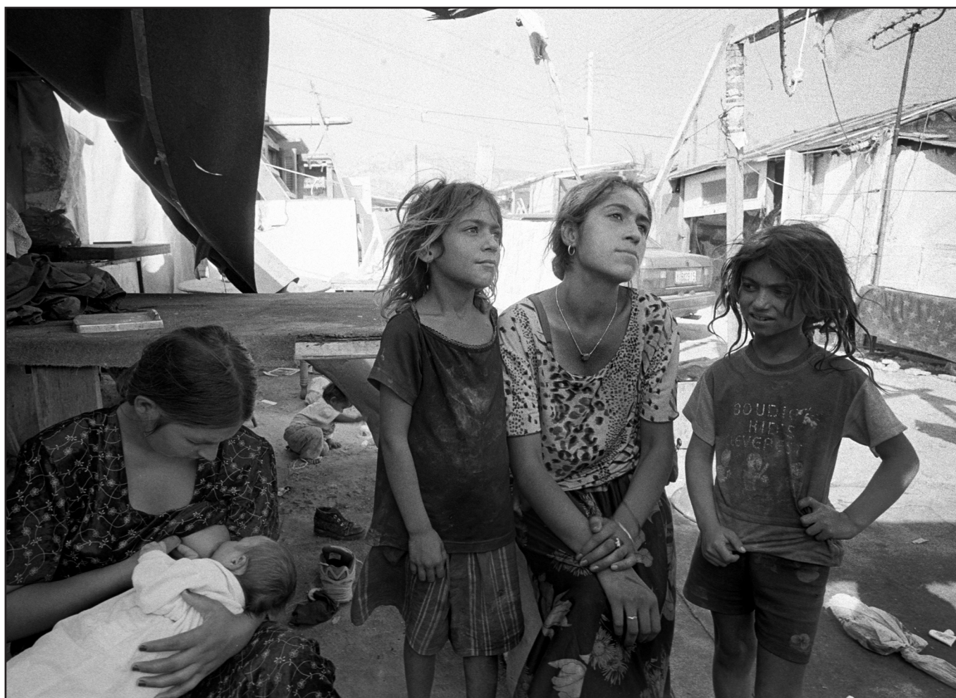
Life conditions of Albanian families, Athens.

The EU approach to humanitarian interventions recognises that special care must be taken to protect children in emergency situations who are especially vulnerable, and thus all programmes are to have a special focus on children's welfare. Whilst such measures can contribute to the protection of children from trafficking there is also a need for specific measures, both during the emergency itself or in the rehabilitation period, which are not currently present in EU policy.